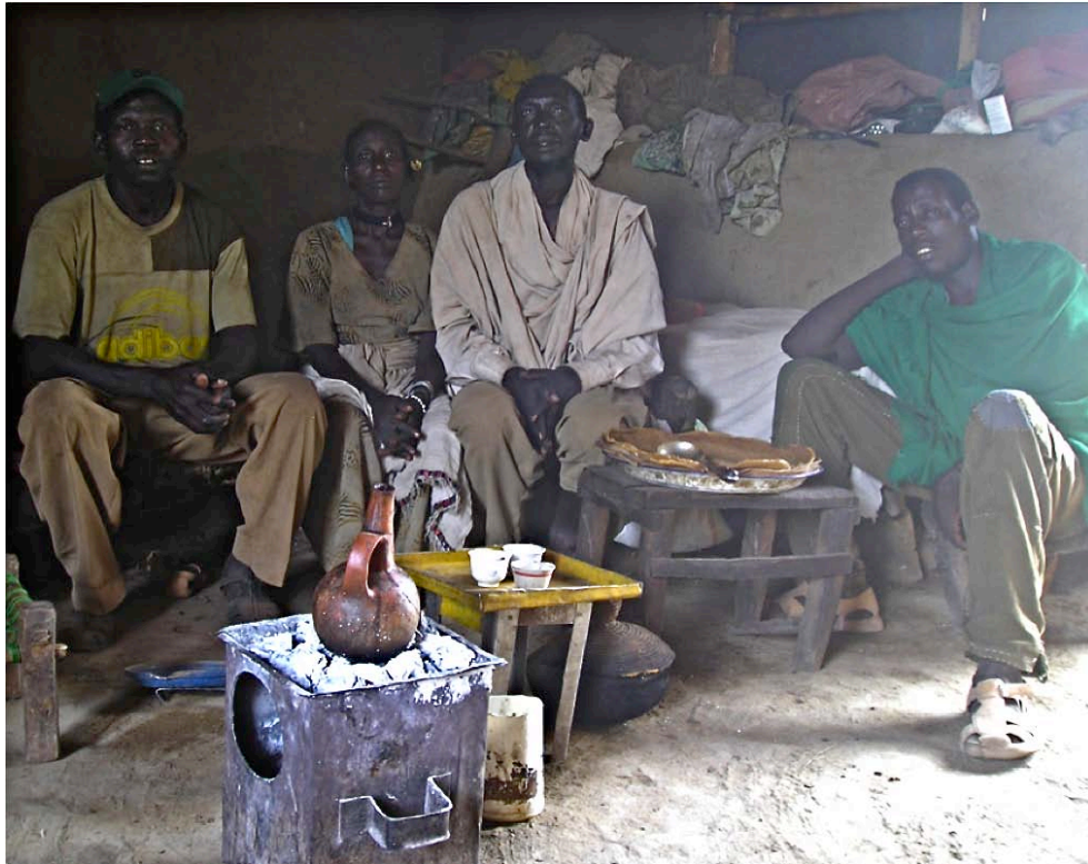
Fig. 3: Ch'aré family and neighbour in their home in May Gaba, illustrating their adaptation to the dominating Tigrīñña culture (female hairstyle and gold jewellery, injera, coffee equipment), March 2008

and Tsebri. The Abigar are known as a subgroup of the Nuer. The informant explained, that some of them had lived here for generations, but were originally brought from the southwest – sometimes over very far distances – by the Ḥabesha overlords of Mezega and Tsebri. All of them have lost their language and their group identity, except the Ch'aré and Shiro, of whom, however, the last reliable informants have just died recently, according to him, or are living far away in remote villages. He remembered having heard that there was a relation between the Ch'aré and the people of Dejjiyatmanja in Qwara, “behind Metemma”. He was the only one to refer to such a relation.